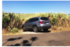
Entrada principal a la finca