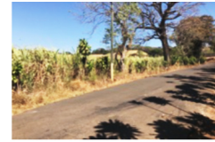
Frente de propiedad