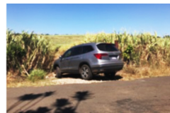
Entrada principal a la finca