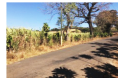
Frente de propiedad