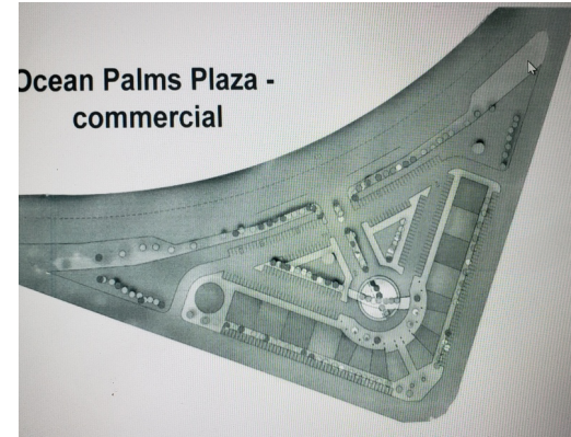
Ocean Palms Plaza - commercial